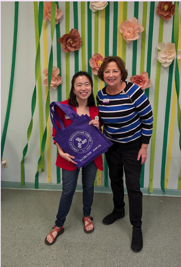
April 26 - North Newstead Association Open House