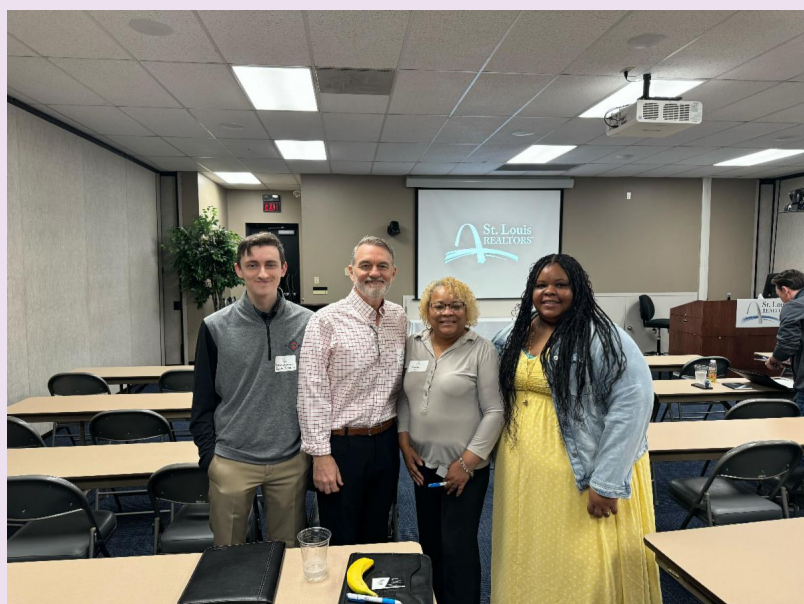
April 17 - SLAA New Member Breakfast