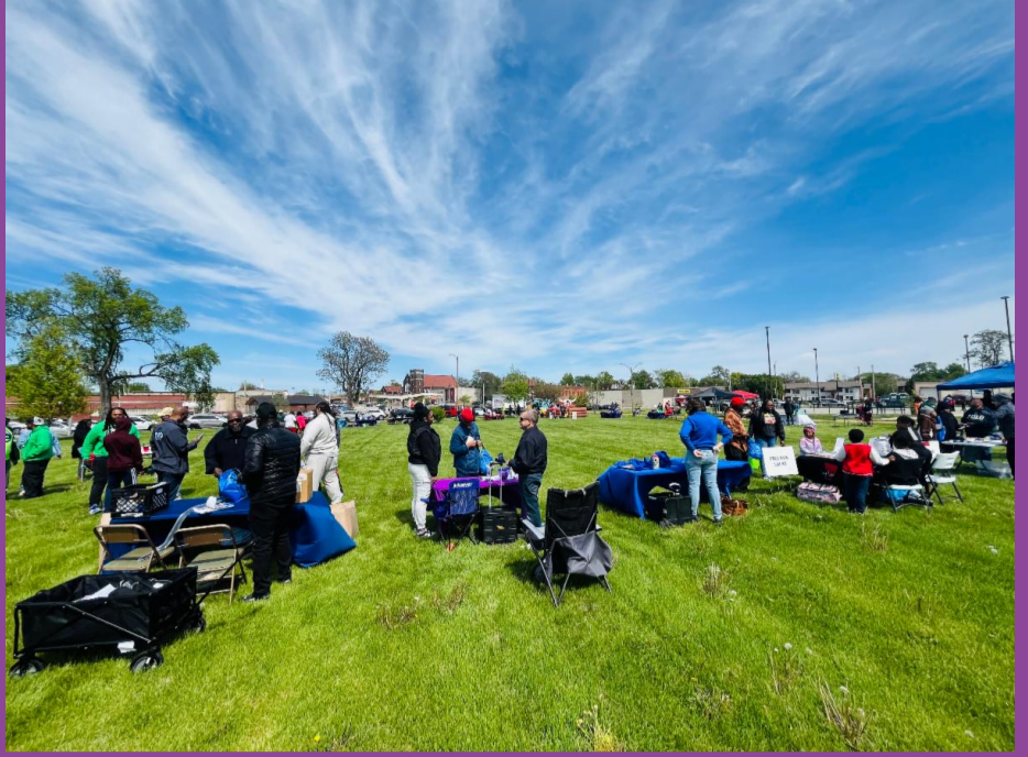
April 20 - Tabling at the OVP Kickback at Fairground Park